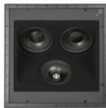
R1C SKU 93351