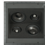
R1SURC SKU 93352