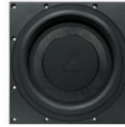
R10SUB SKU 93354