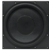
R12SUB SKU 93355